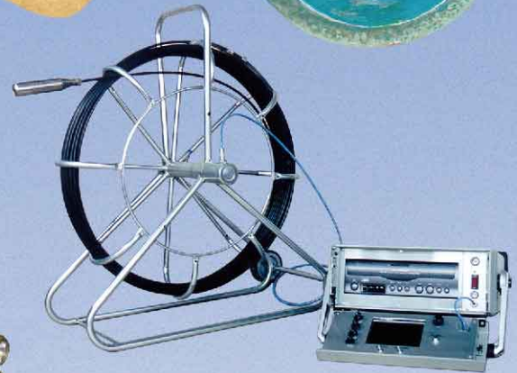
Portable push-rod CCTV system CCTV inspection for pipelines from 35 mm to 400 mm in diameter, chimneys, air ducts and ways, wells and other civil facilities