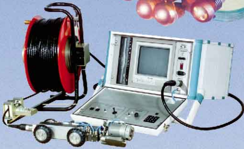
P-100 CCTV Robotic System CCTV inspection for pipelines from 90 mm to 900 mm in diameter