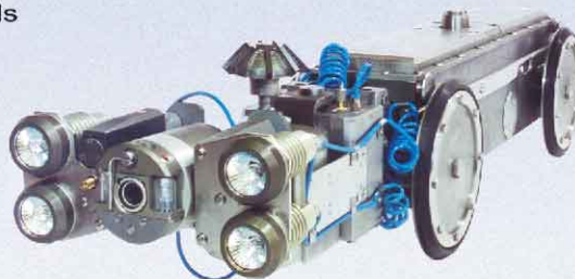
C-200 CCTV Robotic System CCTV inspection and cutting works for pipelines from 200 mm to 600 mm in diameter