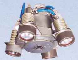
Well's Video camera CCTV inspection for wells up to a depth of 400 meters

Sealing defects (cracks, breaks, leaks) in pipelines from 200 mm to 900 mm in diameter by inside sleeve installation methods