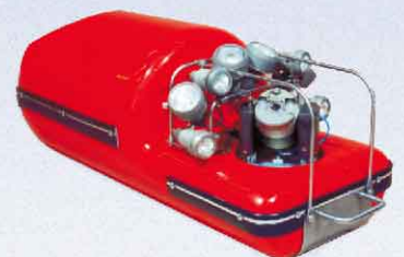
W-400 Floating Module (pontoon) CCTV inspection for partially filled drain pipelines from 400 mm to 3500 mm